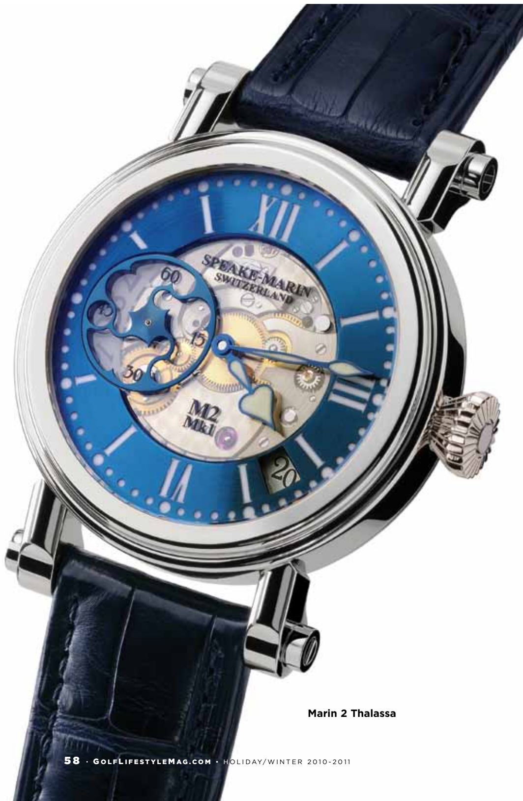
Marin 2 Thalassa