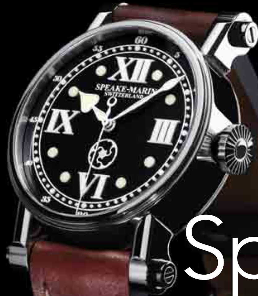
With Speake-Marin's instantly recognisable Piccadilly case, Spirit Pioneer comes in a limited edition of 68 pieces.