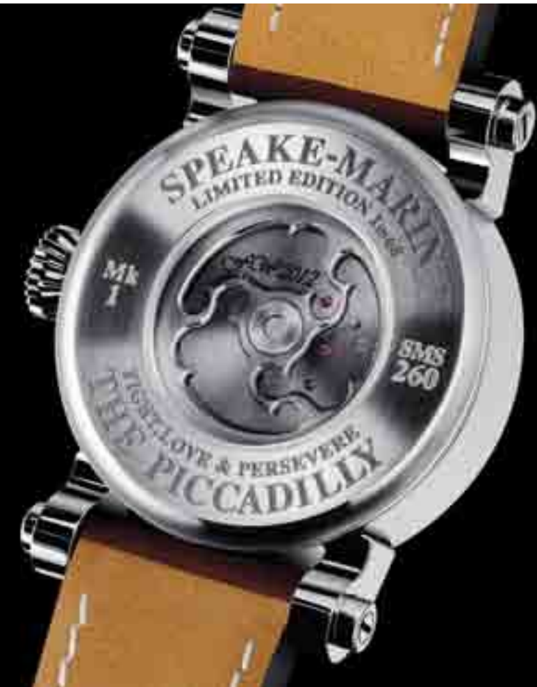
On the reverse of the watch, the 'topping tool' winding rotor is visible as well as the motto "Fight, Love and Persevere", which is engraved on the caseback.

Having produced a world premiere at SalonQP, boutique brand Speake-Marin honours its founder's past while looking forward to a spirited future.