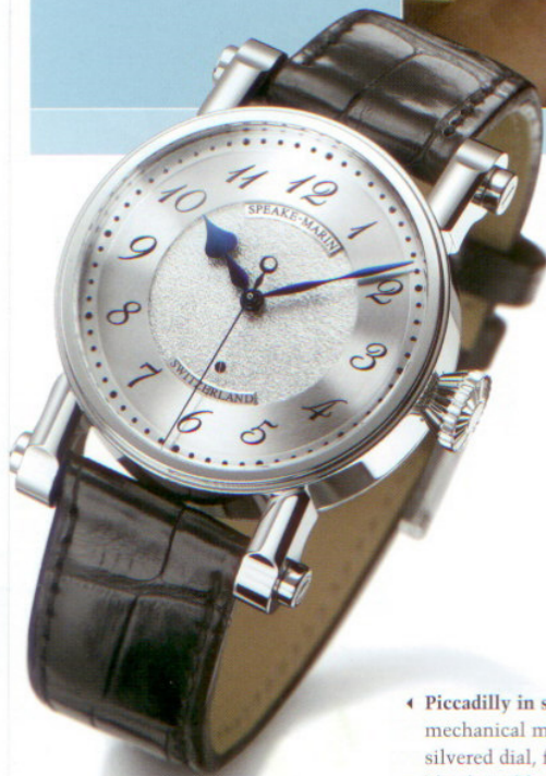
◀ Piccadilly in steel with automatic mechanical movement, 18ct gold silvered dial, frosted finish by hand, blue steel hands, 18ct gold/steel crown and tube, sapphire glass front and back (dimensions of case: diameter 38mm, thickness 13.5mm)