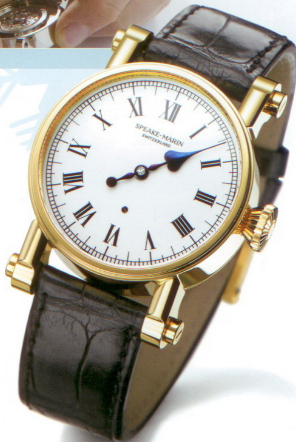
▶ Piccadilly Shimoda with automatic mechanical movement, indication of time through one single hand turning once every 12h, diamond set onto the seconds post in the centre of the hand, 18ct gold/steel crown and tube, sapphire glass front and back, (dimensions of case: diameter 38mm, thickness 13.5mm)